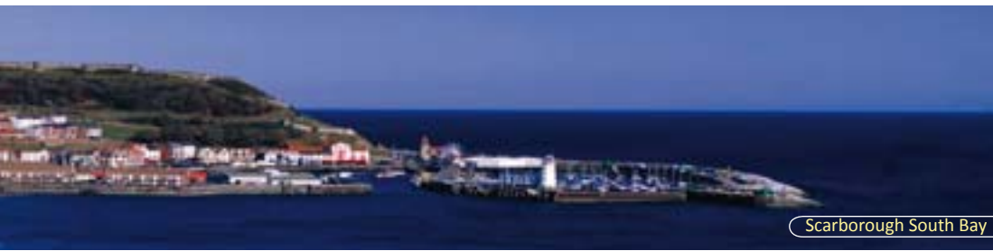
Scarborough South Bay