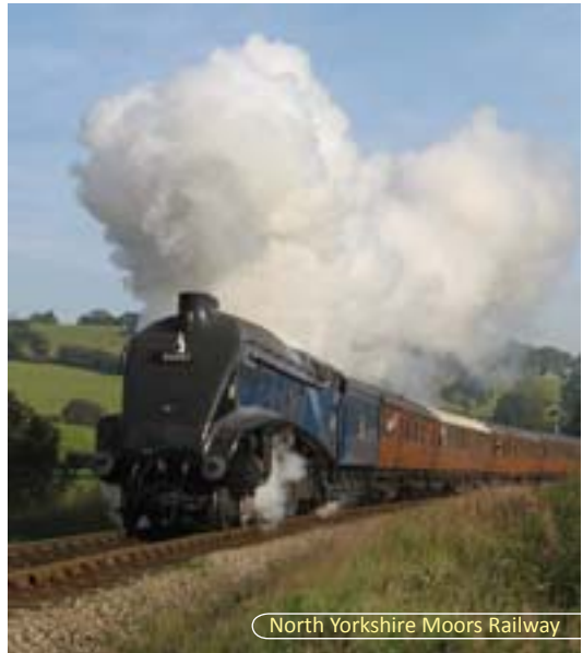
North Yorkshire Moors Railway

York is less than 40 miles inland and well worth a visit to explore the Roman City with its magnificent Minster and city walls, The Shambles and the National Railway Museum.