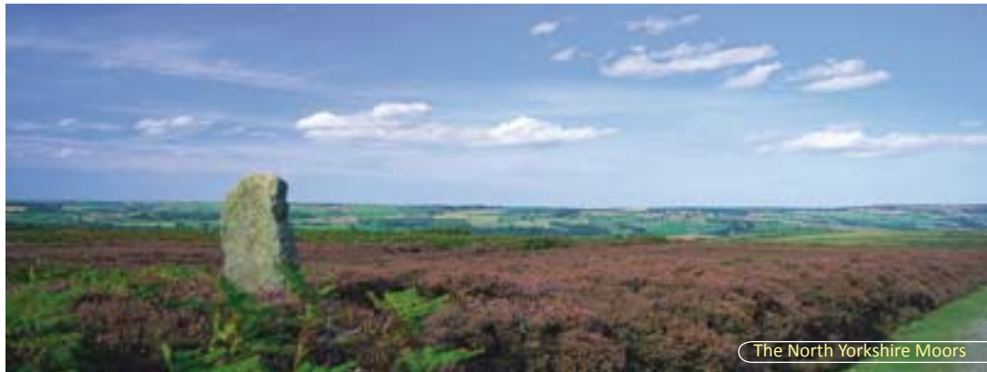
The North Yorkshire Moors